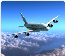
Aerospace & Defense

Arolux® PEKK is the first thermoformable PEKK product. The thermoformable characteristics of Arolux® PEKK expand the application possibilities for high temperature ketone polymers. It is inherently flame retardant and meets the flame, smoke, and toxicity (FST) requirements for use in commercial and military aircraft applications.